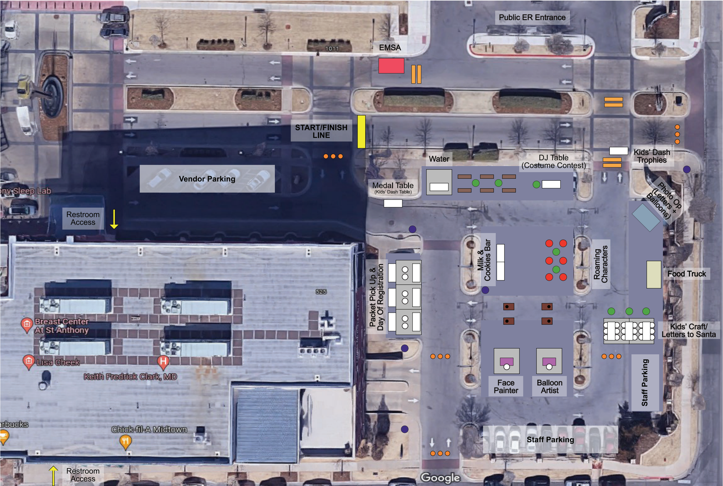
Exhibit A-1 & C